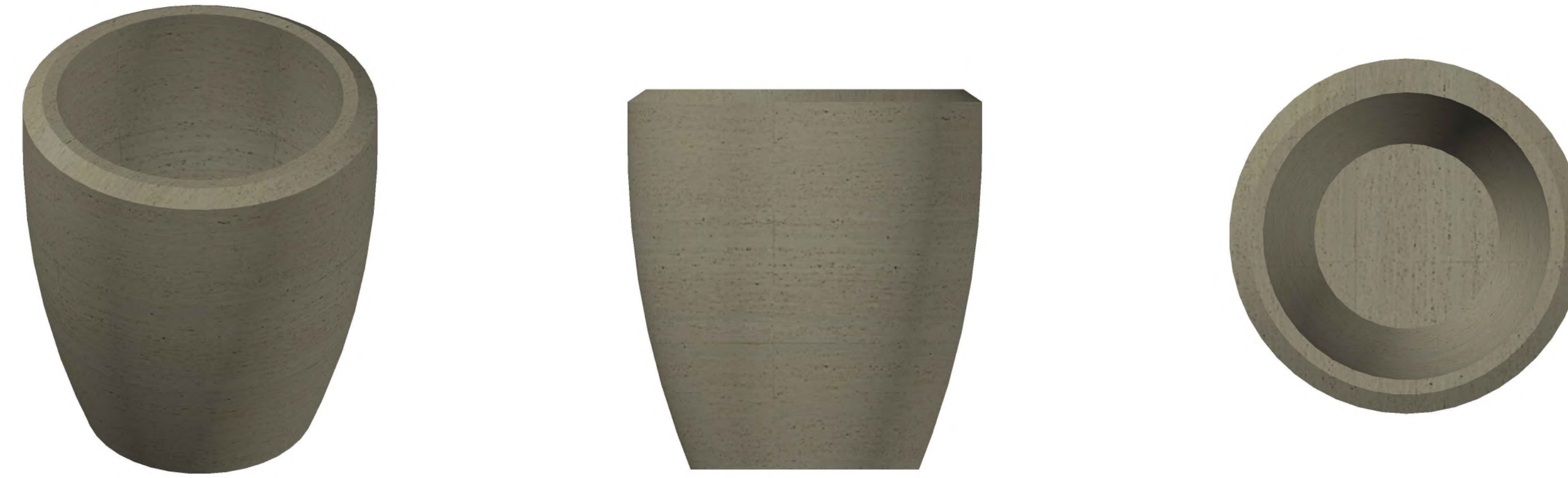
28"Dia.x 30" Ht.Planter 3D Views (QTY.12)