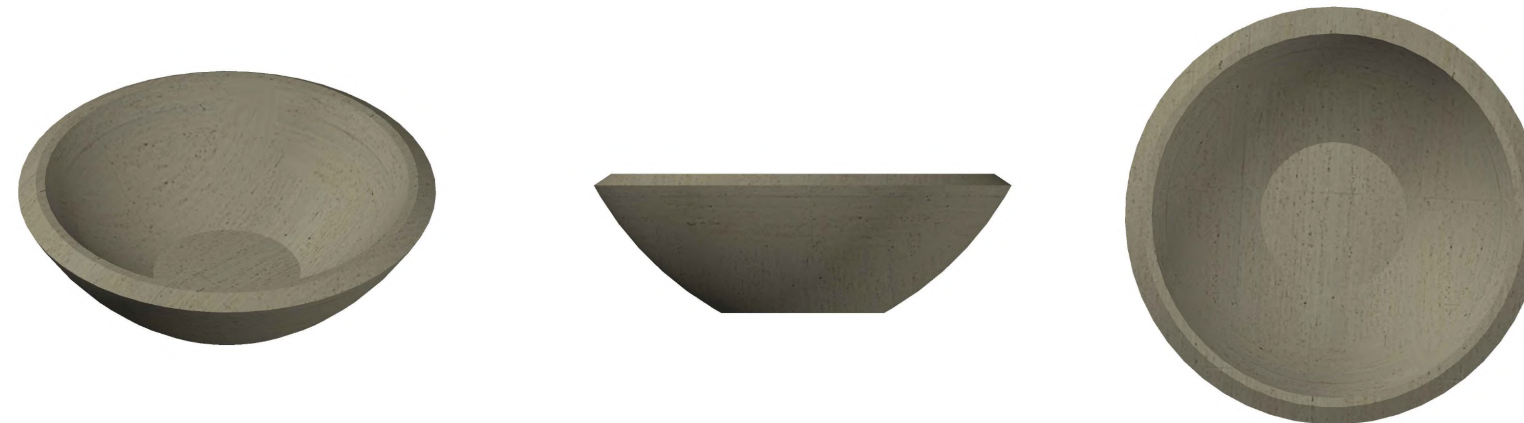
36"Dia.x 12" Ht.Planter 3D Views (QTY.12)