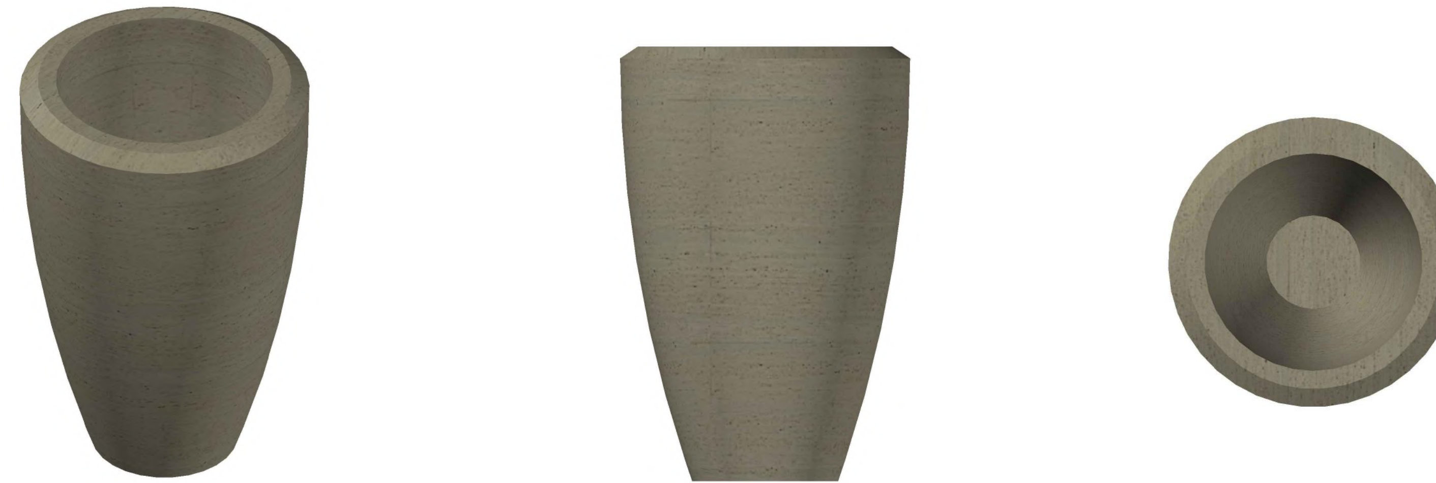
24"Dia.x 36" Ht.Planter 3D Views (QTY.12)